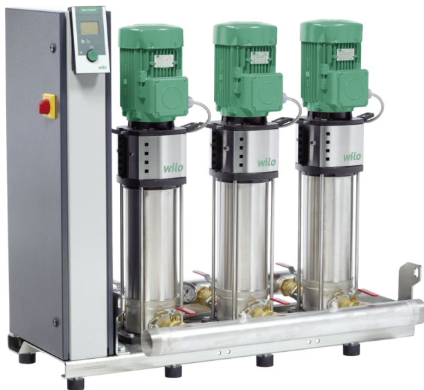
Wilo-SiBoost Smart 3 Helix V